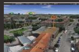
Multi - Dimensional Maps