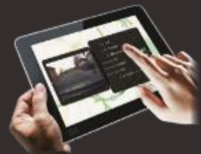
Dynamic Decision Support