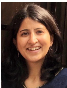
Indirapriya TA Solution SME Integrated Commerce Platform