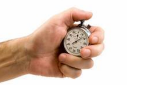
Faster & Cheaper