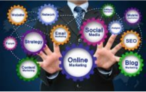
Next generation digital tech