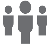
Excel In Experience