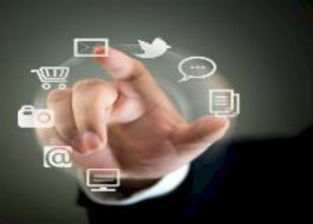
Flexible & Seamless Core